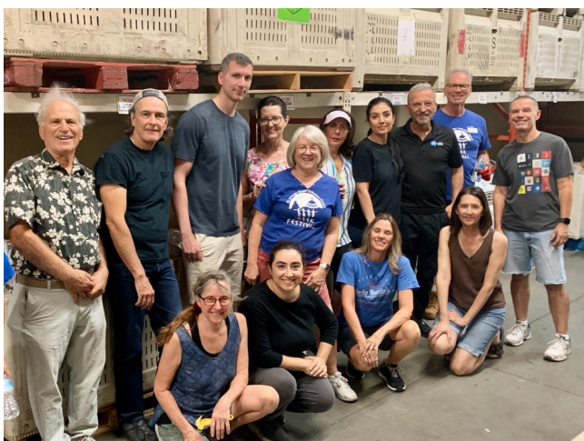
St. George parishioners joined our Philoptochos leadership to help in the efforts of the Narrow Door Food Bank in feeding the needy on August 24, 2024.

In June, members of our St. George Philoptochos came together to bake 1,000 koulourakia for the Metropolis Philoptochos' hospitality efforts at the National Philoptochos Convention held in San Diego, California from June 30th-July 4th. On Saturday, August 24th , members of our parish joined in the St. George Philoptochos effort to box food for the needy at the Narrow Door Food Bank in Indio, California.