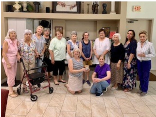
Philoptochos members prepared pastries for the National Philoptochos Convention from June 30th-July 4th 2024.